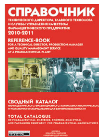
3rd issue 2010-2011 352 pages