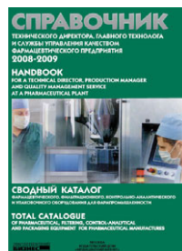
2nd issue 2008-2009 320 pages