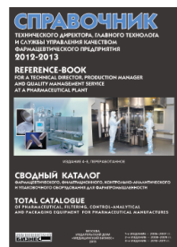
4th issue 2012-2013 336 pages