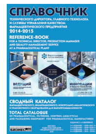
5th issue 2014-2015 368 pages