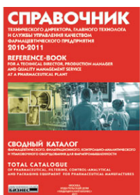
3rd issue 2010-2011 352 pages