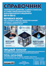
5th issue 2014-2015 368 pages