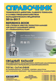
6th issue 2016-2017 332 pages

Our address: Russia, 111024, Moscow, Aviamotornaya str., 51, office 26 E-mail: medbus@mail.ru • http://www.medbusiness.ru