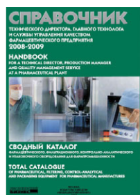
2nd issue 2008-2009 320 pages