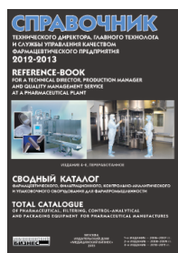
4th issue 2012-2013 336 pages